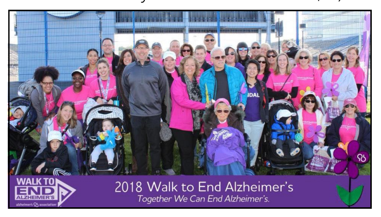
Staffers join other Hartford HealthCare walkers for this group shot.

The Arbor Rose and Jerome Home Team walked to End Alzheimer's on Oct. 14 at Rentschler Field in East Hartford. This year the team raised over $11,400 and was listed in second place in fundraising